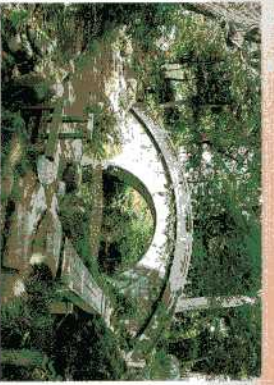
Engetsu-kyo (Full Moon Bridge)

The reflection of the bridge in the pond produces a full circle with the appearance of a full moon. The design of this bridge is said to have been created by the Confucian scholar, Shu shunau of the Ming dynasty. It has important historical significance because, along with the Tokujin-do, it has survived in its original form and provides a glimpse of the early Edo period.