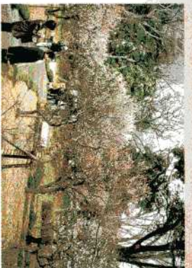
Bairin (Ume grove)

Home page: Home page updated with the latest information: http://www.tokyo-park.or.jp