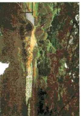
Naitel (Inner garden)

In the latter part of June, irises occupying a plot of about 1,000sqm (660 plants) are in bloom. When the ume trees are in bloom, they give the garden the appearance of an idyllic country scene.